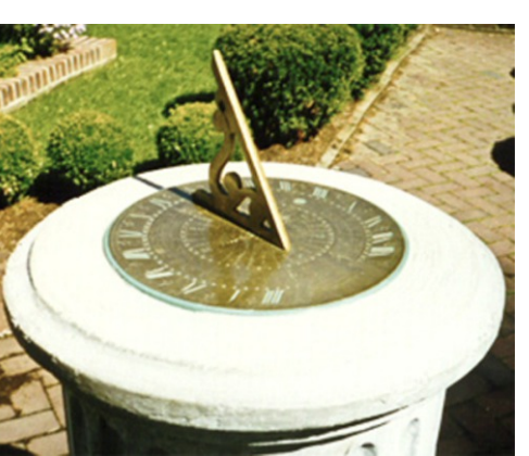
where, if you ever the type of sundial found in many public places need to move your sundial, you can turn it. This will help ensure the sundial's accuracy.

1. Place a 2-by-3 foot flat piece of cardboard or wood in an outside spot that has full sun exposure. Be sure to choose a spot where, if you ever