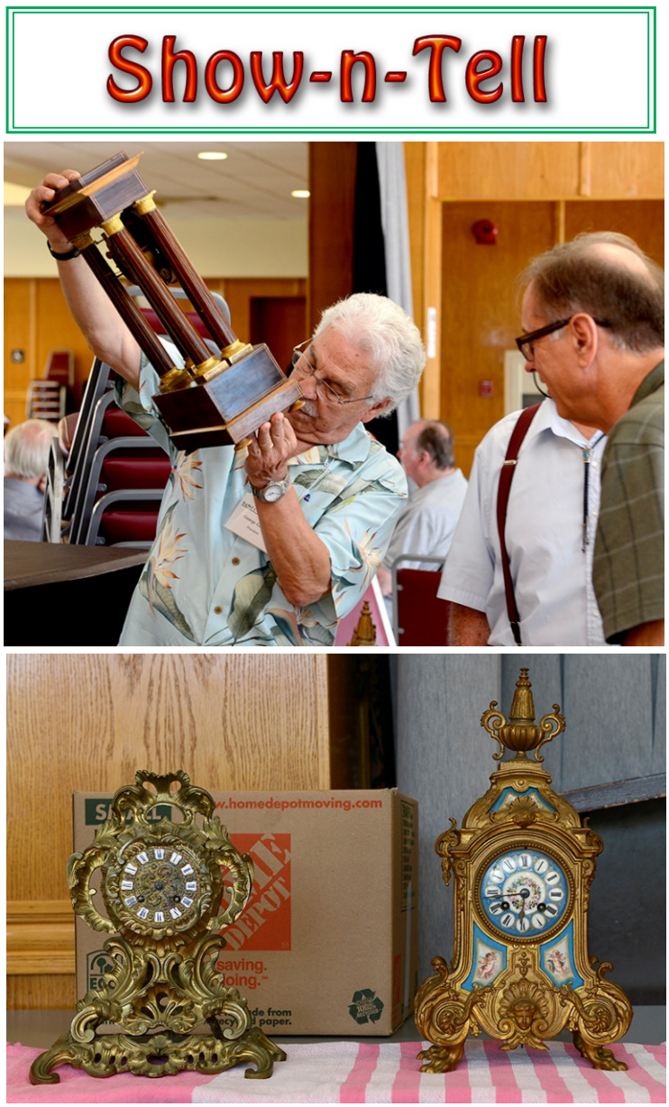
More photos on page 5.

For a full array of sundials: <u>http://www.sundials.co.uk/projects.htm</u>.