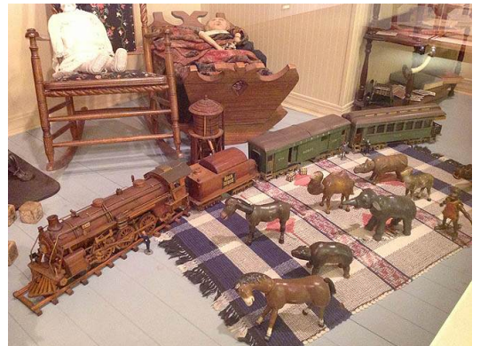
Old wooden toys and dolls

that for the random visitor, there was no explanation about the clocks either in general or for specific clocks. For obvious reasons there was no knowledgeable docent on hand that could explain some of what is there. I think some sort of information is necessary to draw people in and help them understand the significance of the items on display. This is not a criticism because I realize how much work has already gone into creating and maintaining the museum by the folks involved and they have done a great job. This would be a worthy project for