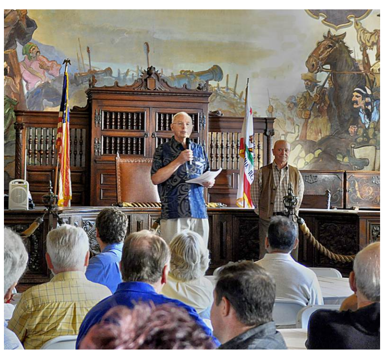
Our Fearless Leader