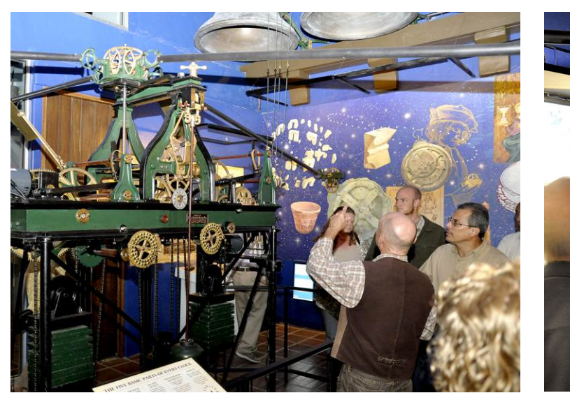
The Clock Gallery Tour