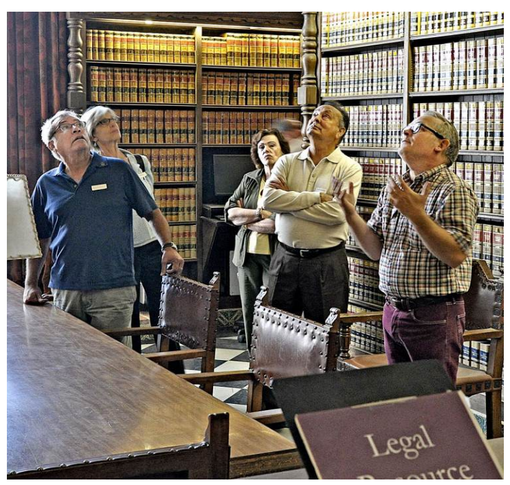
The Law Library