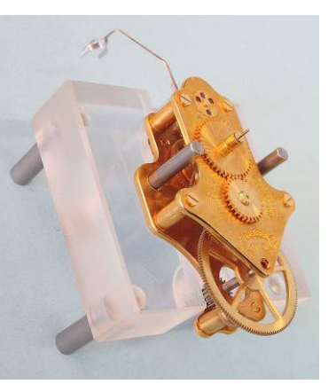
The Movement With Fork

jeweled Atmos movement is to turn the minute hand shaft one complete revolution per hour and the cannon pipe one revolution per twelve hours. It accomplishes this through a going train powered by a mainspring. Stored energy in the mainspring applies the pressure needed. This pressure is controlled by an escape mechanism that