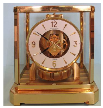
1972 Atmos Caliber 528

in Calabasas from snowy Nashua, New Hampshire, with the purpose of establishing a West Coast Regional office for my employer. But I knew where Ventura Boulevard was in the San Fernando Valley and that a prominent Sherman Oaks jewelry store was going out of business. "Seventy percent off of everything!"