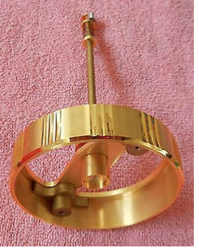
Balance with impulse roller

Once set in motion, the suspended balance will oscillate for many hours with no external influence. To prevent this motion from its natural inclination to stop the Atmos movement provides periodic impulses through a lever fork that engages an impulse roller on the balance