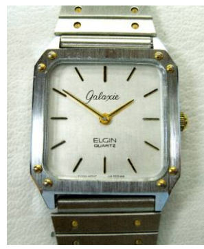
Left: The famous Movado Museum Watch. The dial design patented in 1958 by Nathan Horwitt Right: An early Elgin Quartz dress watch in stainless steel. The movement is Japanese.